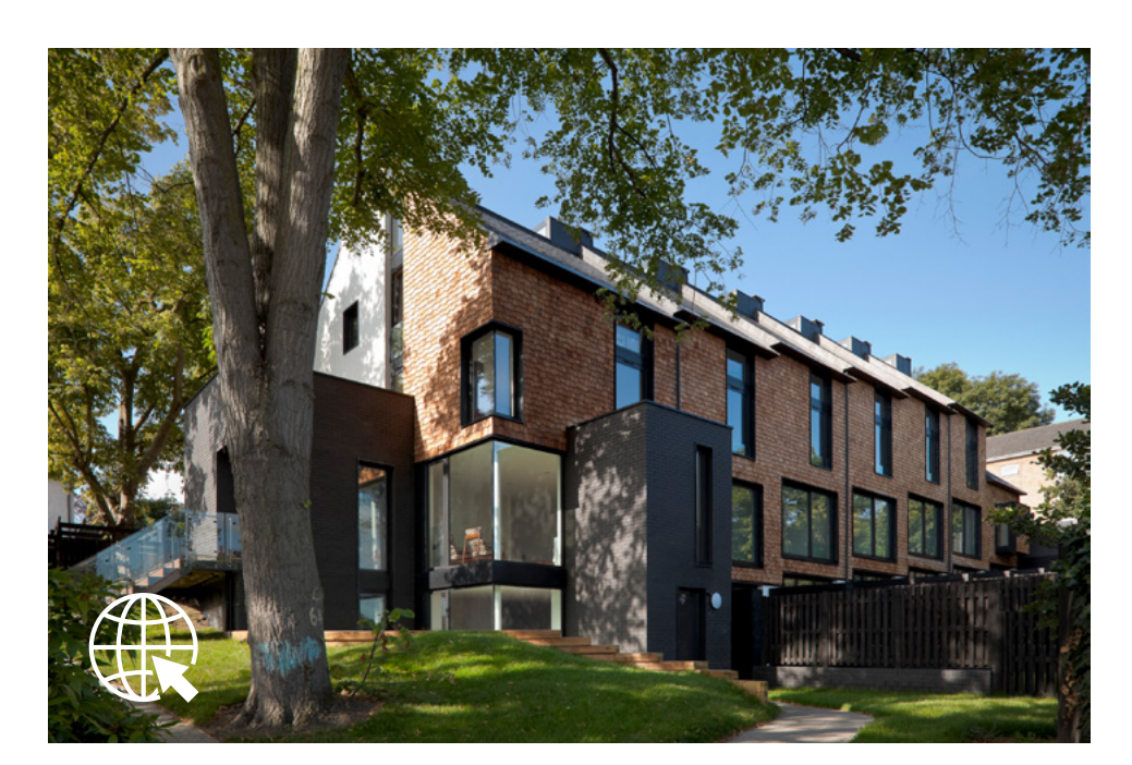
Connaught Gardens Muswell Hill