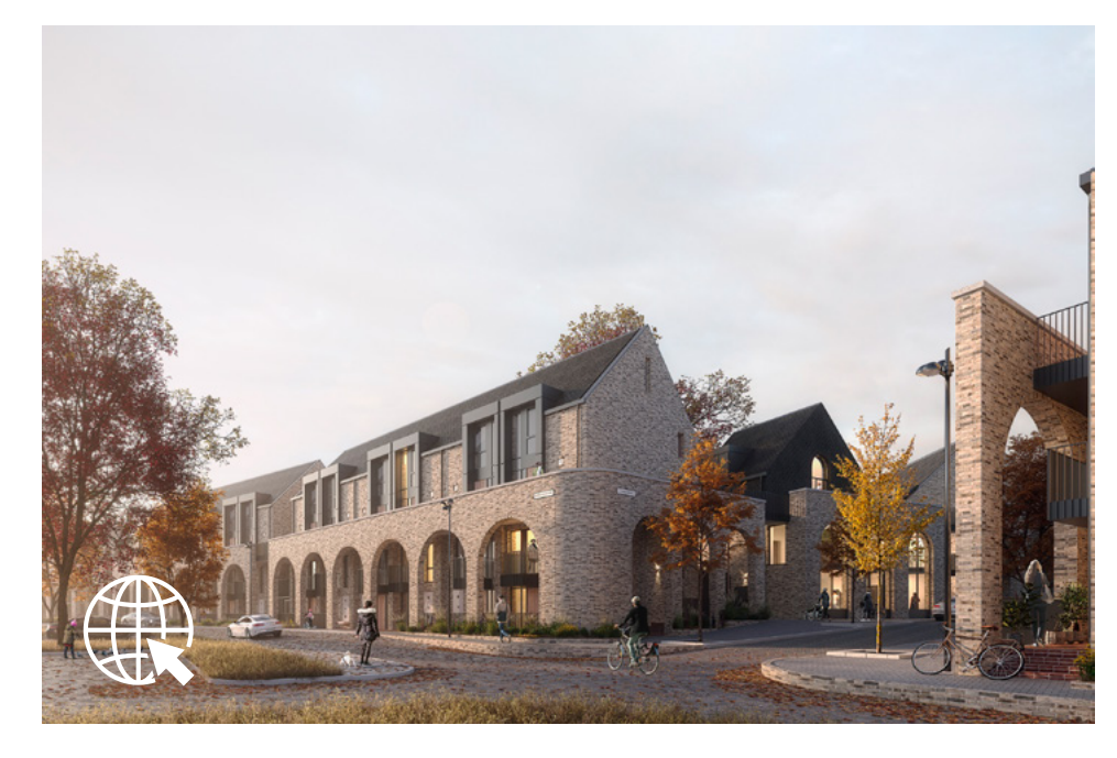
Park Road, Syon Park Hounslow