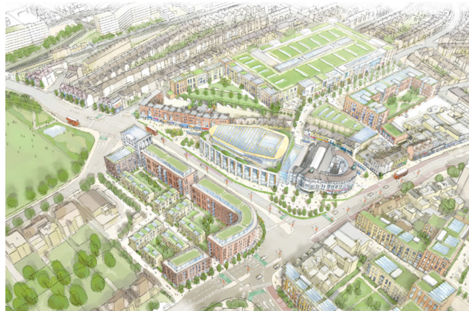
Catford Town Centre Lewisham