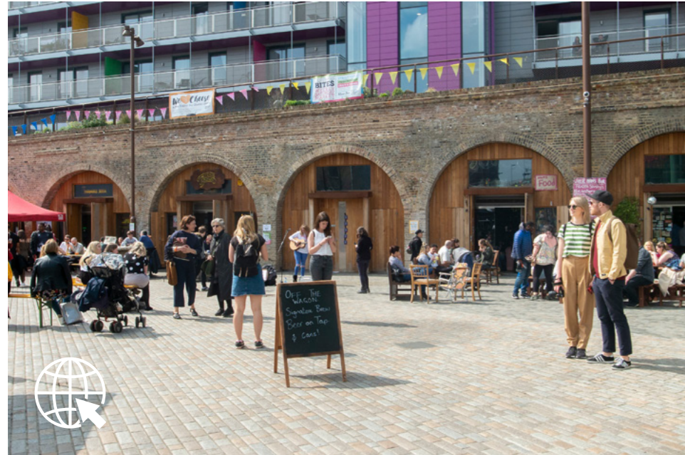
Deptford Market Yard Lewisham