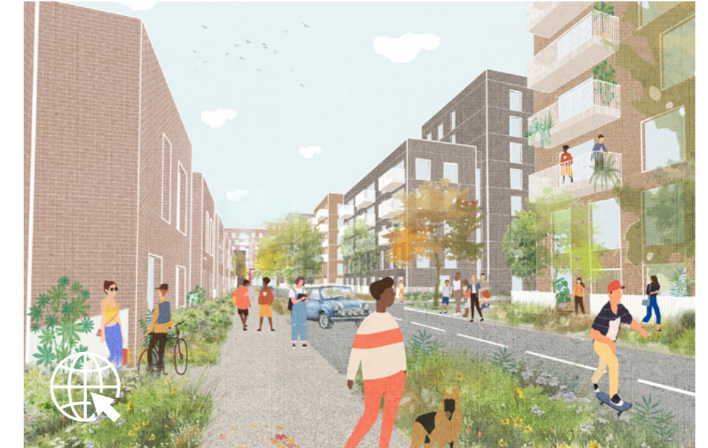
Hayes Town Centre Hillingdon