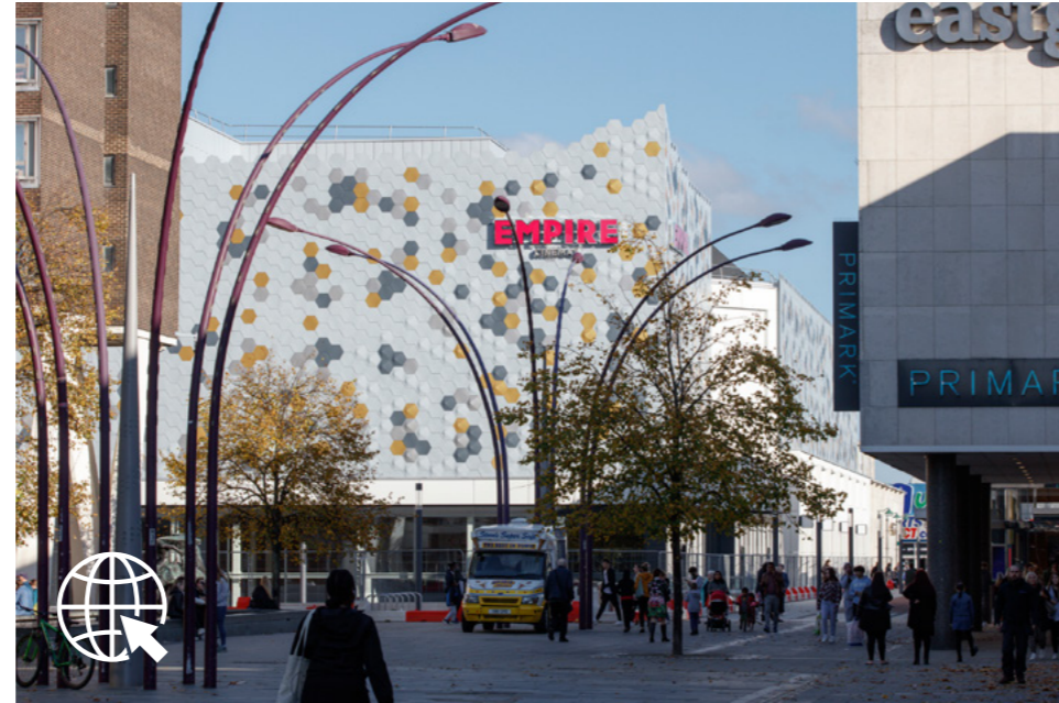
East Square Cinema Basildon