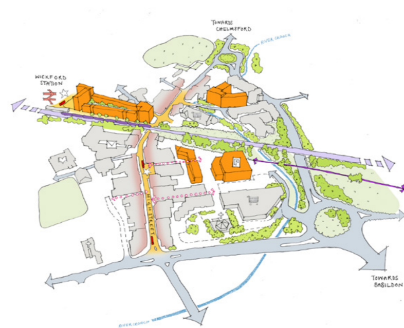
Wickford Town Centre Basildon