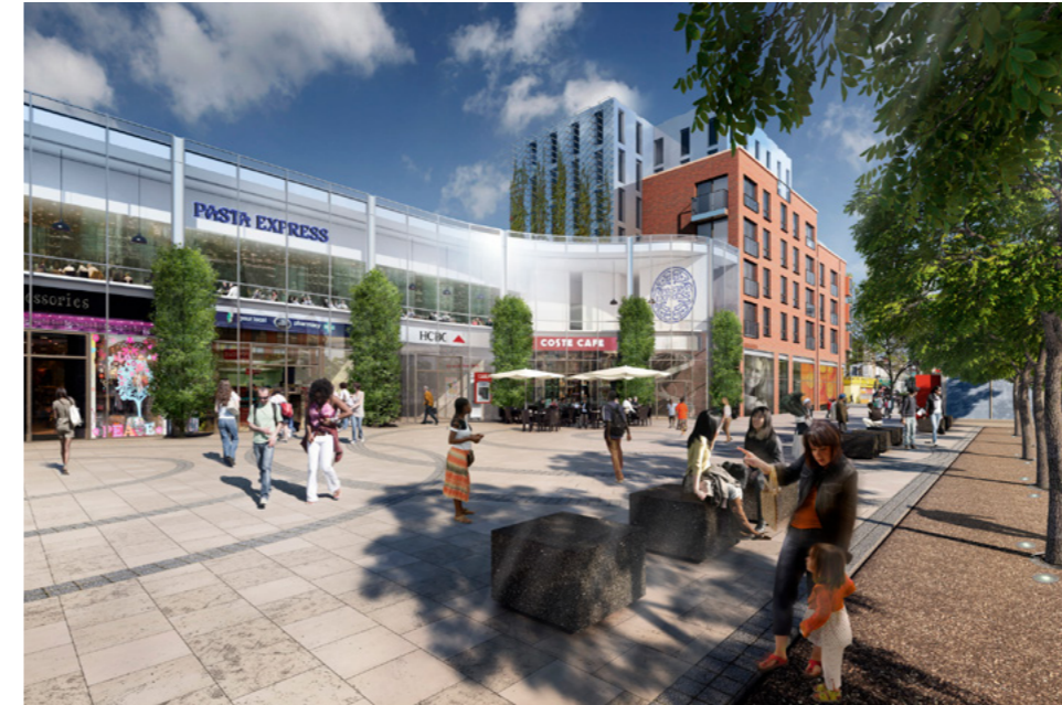
Wards Corner Haringey