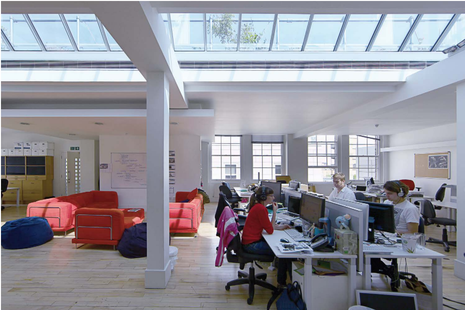
Somethin' Else Hackney