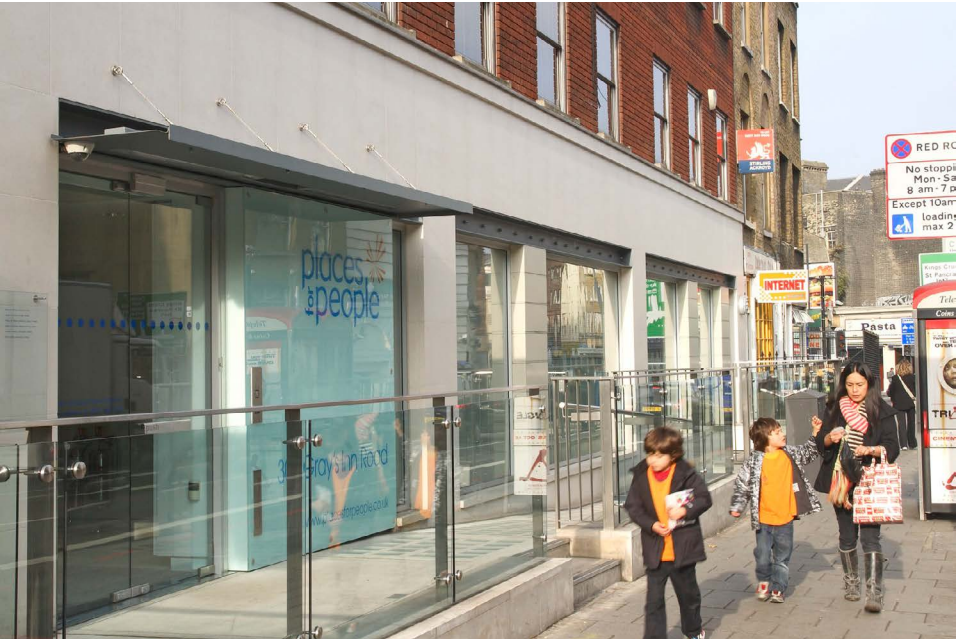
Grays Inn Road Kings Cross