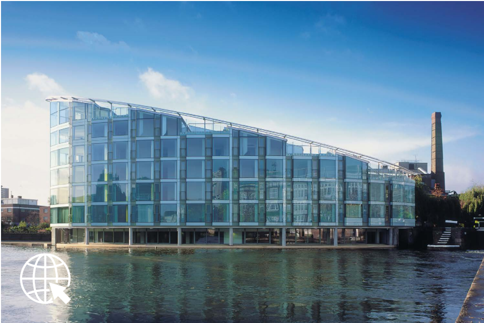
Crystal Wharf Islington