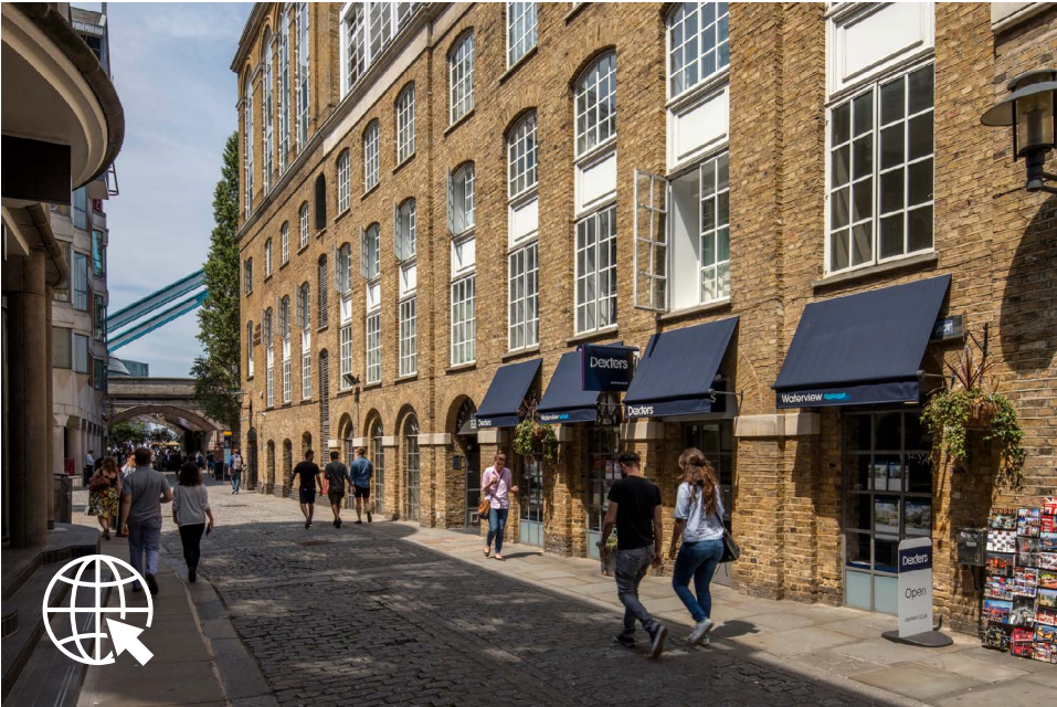
Anchor Brewhouse Shad Thames