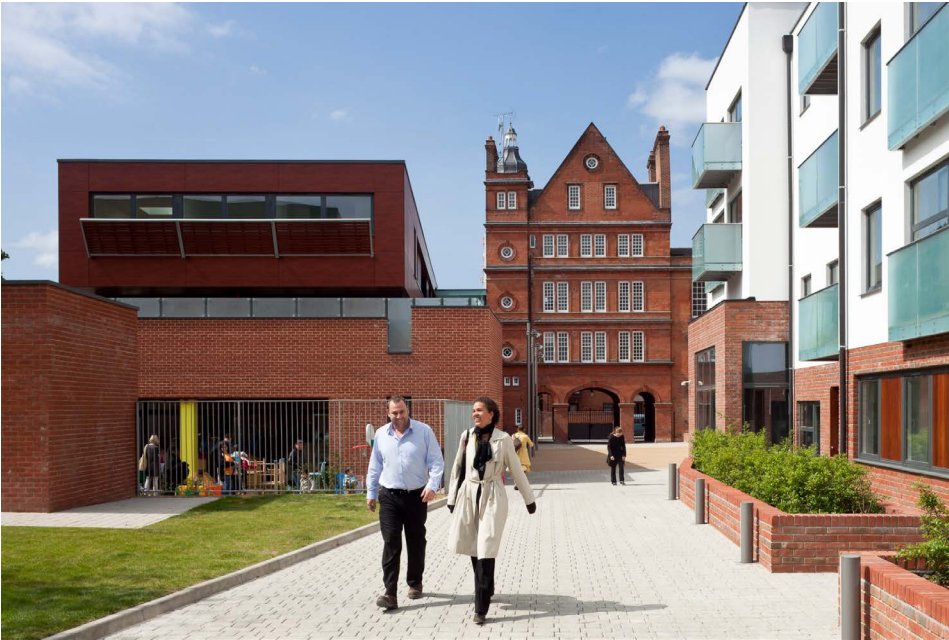
Hornsey Road Islington