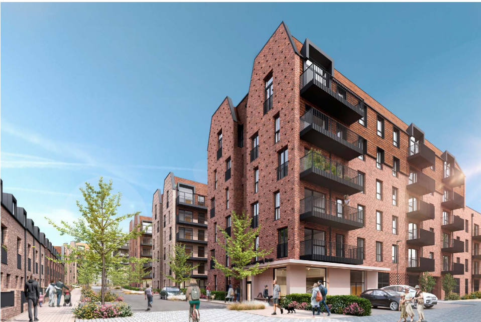
High Lane Ealing