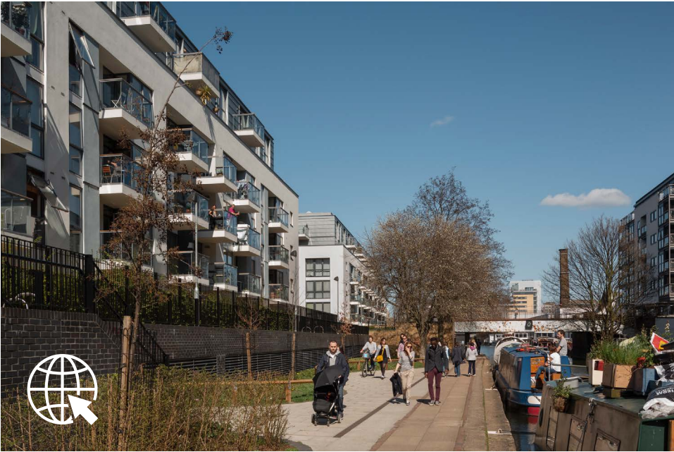
Packington Estate Islington