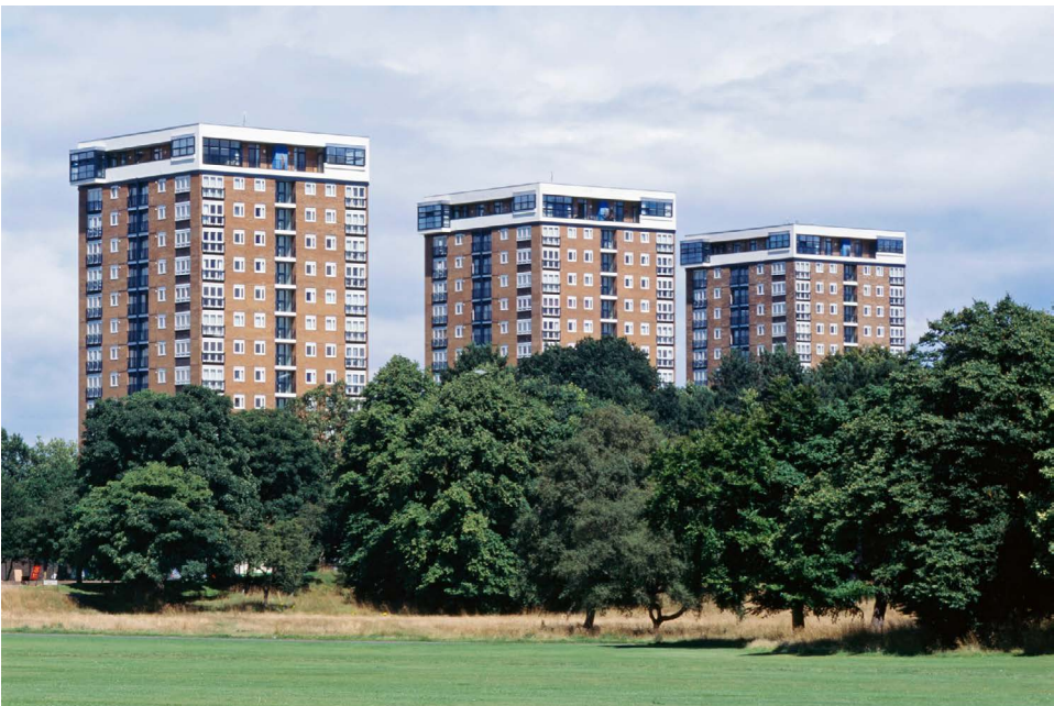
Sefton Park Liverpool