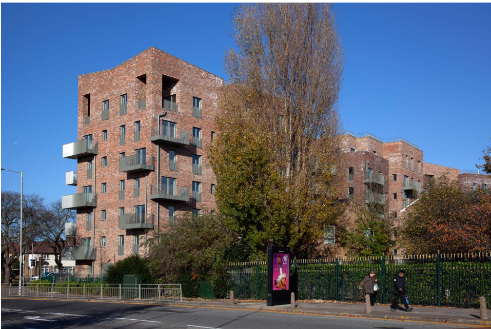
Sebastian Court Barking and Dagenham