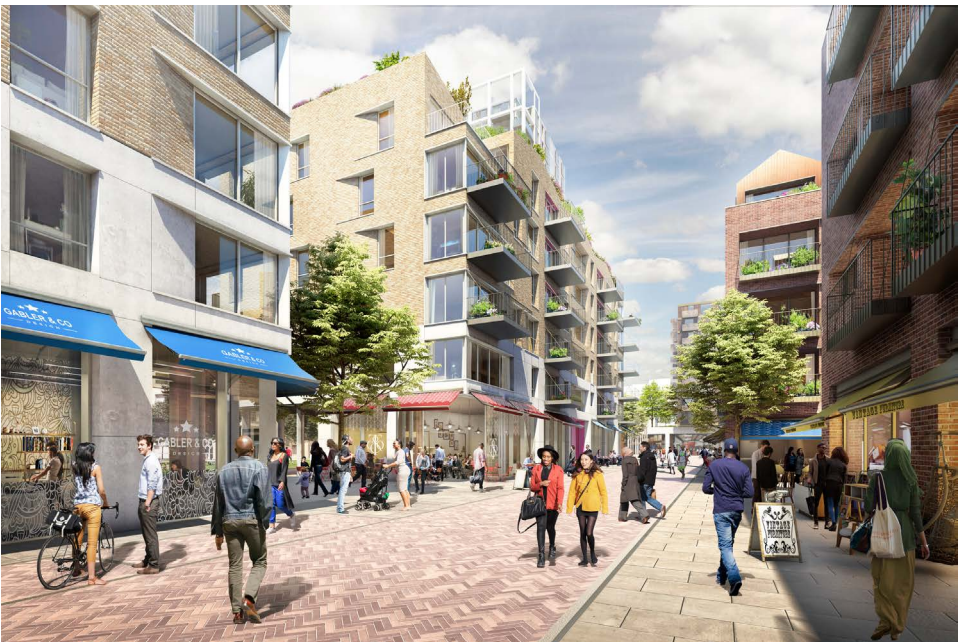
High Road West Haringey