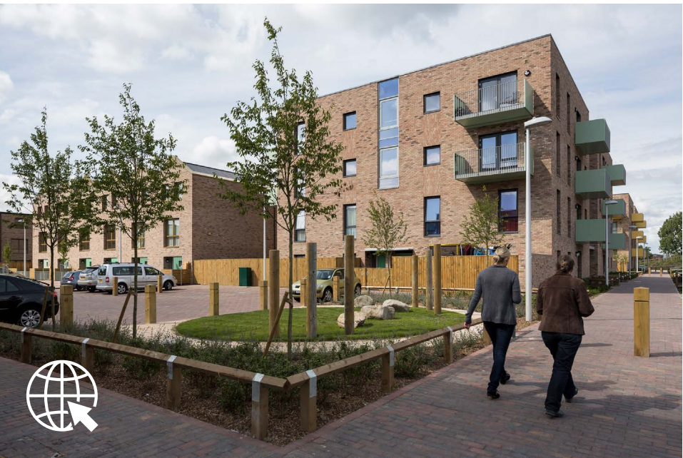
Thames View East Barking & Dagenham