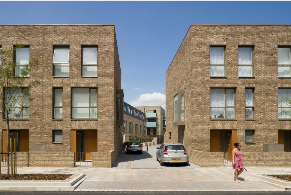
Harvard Gardens Southwark