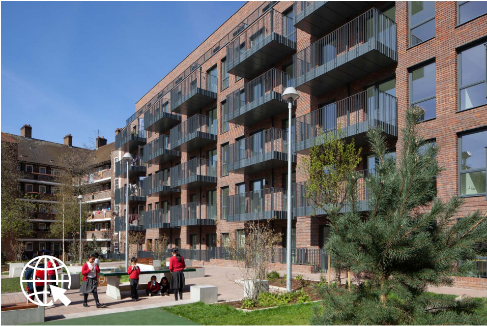
Jolles House Tower Hamlets