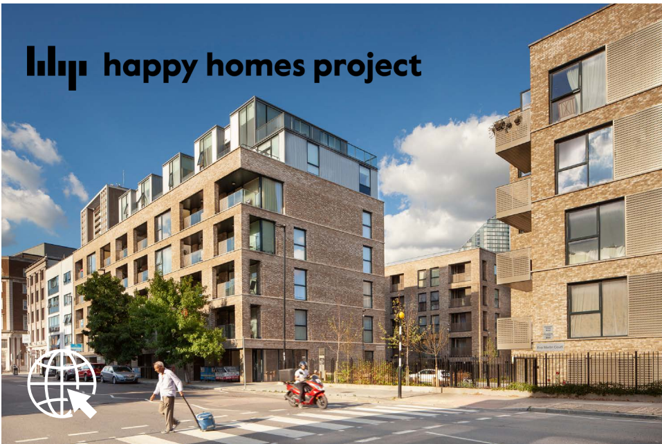
King Square Islington