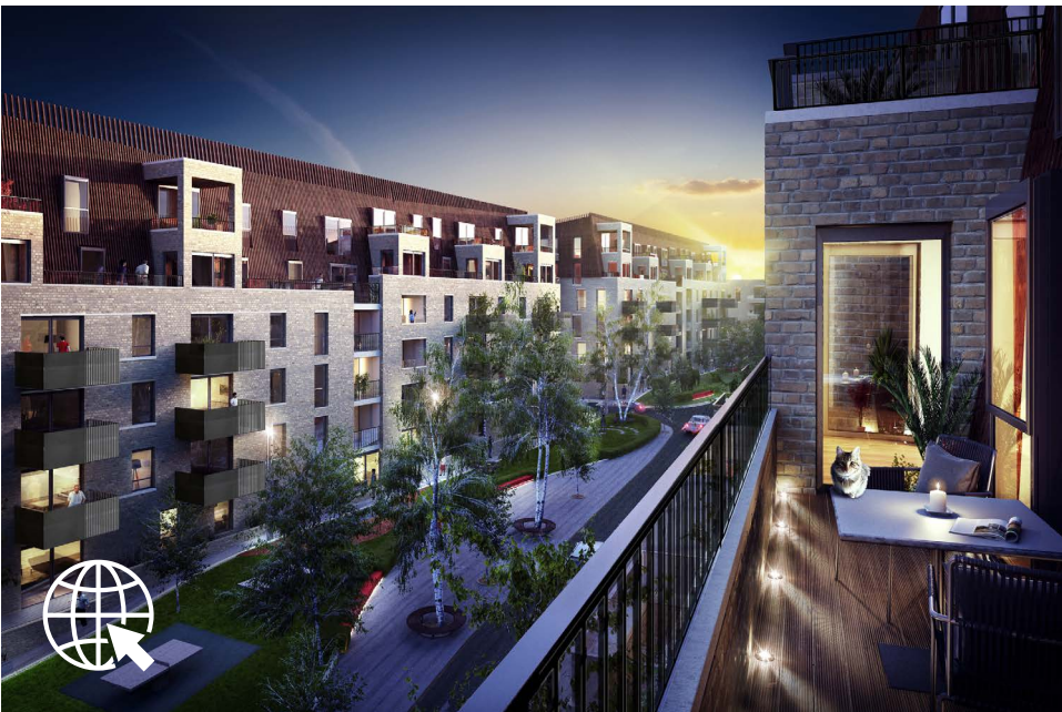
One Woolwich Greenwich