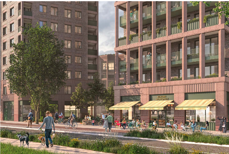
South Kilburn Phases 5&6 Brent