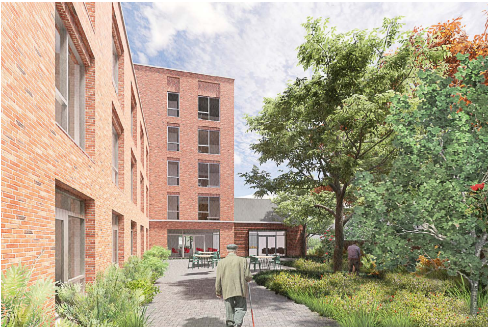
Watling Gardens Brent