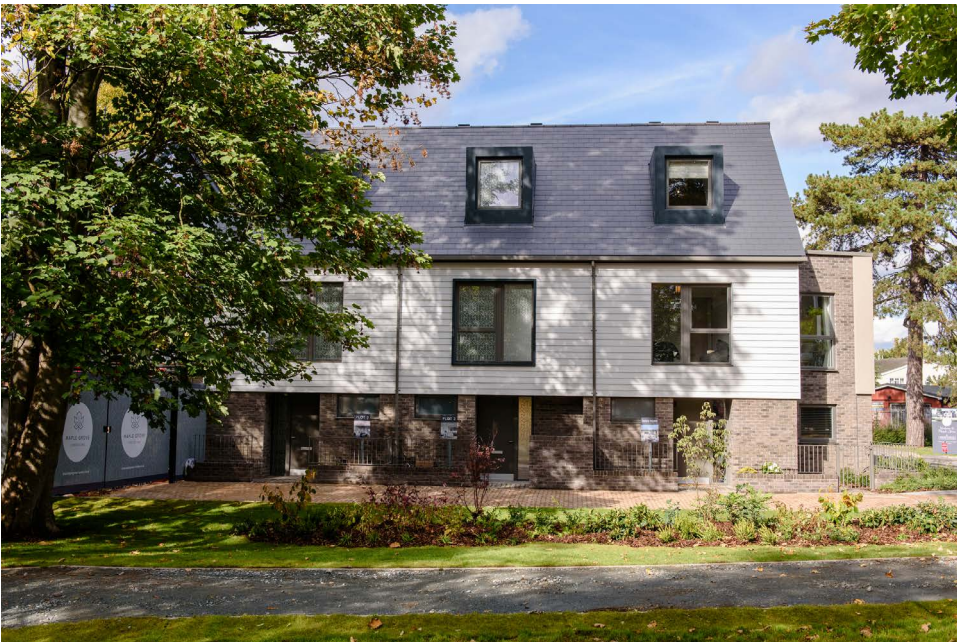
Durand Close Sutton